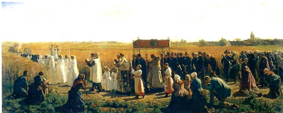
Blessing of the Wheat at Artois by Jules Breton (1827-1906)

Ember Days are spent fasting and praying. They are spent in penance and with the intention of thanking God for the gifts He gives us in nature and beseeching Him for the discipline to use them in moderation. The fasts, known as Jejunia quatuor temporum , or the fasts of the four seasons, are rooted in Old Testament practices of fasting four times a year. Priestly ordinations, prayer for priests, first Communion, almsgiving, and other penitential and charitable acts, as well as prayers for the souls in Purgatory are all customary practices on Ember Days. Note that medieval lore says that during Embertides, the souls in Purgatory are allowed to appear visibly to those on earth who pray for them. Because of the days' focus on nature, they are also traditional times for women to pray for children and safe deliveries. Upcoming Spring Ember Days - Wednesday, Friday, and Saturday after Quadragesima Sunday (the first Sunday of Lent) are known as Lenten Embertide, which, depending on the date of Easter, can come as early as February 11. These days are associated with the season of Spring (March, April, May). As previously stated, this year Lenten Embertide will be March 9, 11, and 12.